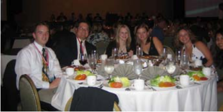
Pi brothers enjoy the closing reception