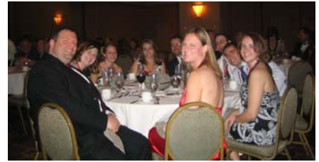
Brothers from Buffalo Grad, Gamma Chi, and Gamma Iota bond over dinner