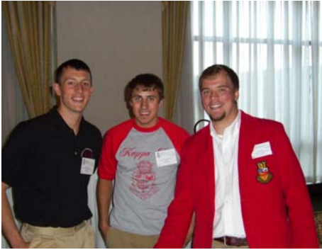
Brothers from the host chapter, Beta Lambda, greeting visitors

Brothers from all over Province V convened in Toledo, Ohio, for the 2007 Midyear Meeting. There were business meetings, an opening dinner at Toledo's famous Tony Packo's, informative workshops, a Poker Tournament, a CE for the graduates, and a closing dinner bursting with brotherhood.