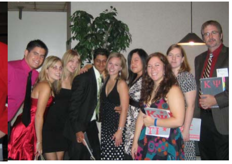
Gamma Iota pledges enjoying Saturday's closing dinner at the Park Inn