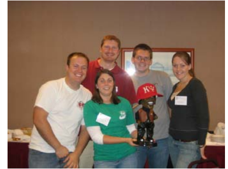
Beta Psi and Wisconsin Grad brothers at the Province V Poker Tournament

Brothers from all over Province V convened in Toledo, Ohio, for the 2007 Midyear Meeting. There were business meetings, an opening dinner at Toledo's famous Tony Packo's, informative workshops, a Poker Tournament, a CE for the graduates, and a closing dinner bursting with brotherhood.